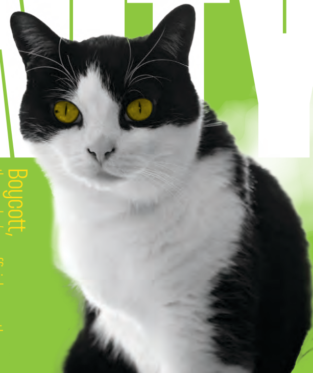
Boycott, the garden's unofficial mascot!